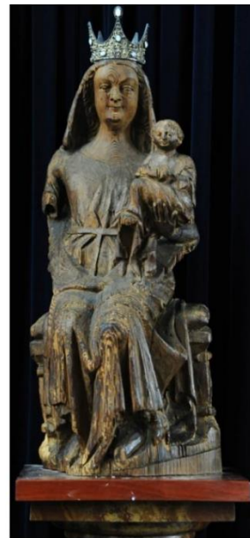
Icelandic medieval wooden statue of the Holy Mother and Child. It is believed to be from the 14th century and was donated to the Catholic Church in 1926. When Pope John Paul II visited Iceland in 1989, he crowned the statue.

Remember, O Creator Lord! That in the Virgin's sacred womb Thou was conceived, and of her flesh Did our mortality assume. Mother of grace, O Mary blest! To thee, sweet fount of love, we fly; Shield us through life, and take us hence To your dear bosom when we die. O Jesus! Born of Virgin bright, Immortal glory be to Thee; Praise to the Father infinite, And Holy Ghost eternally. Amen.